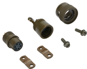
PT-06A-10-6S-SR 6-pin Connector