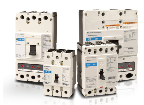
Manufactured by Eaton Corporation

Note: These parts available for sale to North American locations only.