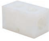
Part No. MRN-2CB