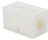
Part No. MRN-2DC